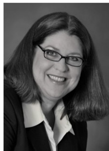
RCNA Member, Milwood Resident